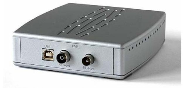
Connections to AT70XUSB

IP Solutions Ltd. www.ip-solutions-ltd.com