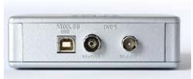
Connections to AT80XUSB

IP Solutions Ltd. www.ip-solutions-ltd.com